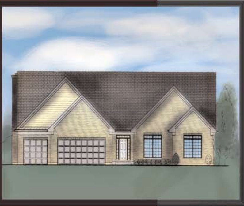
THE POPLAR - 2800 SQUARE FEET